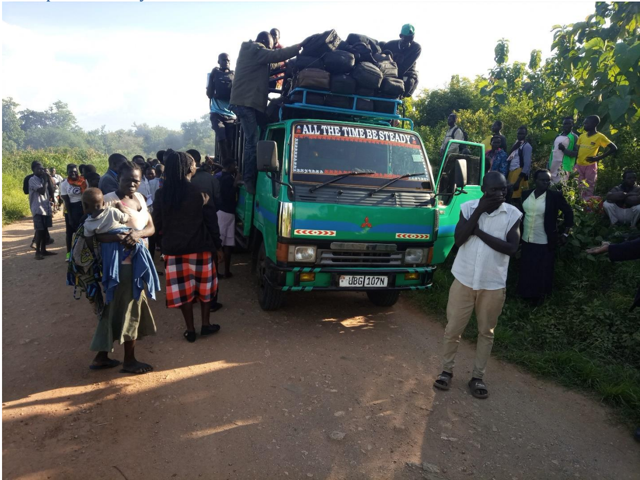
The overloaded lorry transporting youths to Mijale

The logistic committee tried their best to ensure that many youths could attend the youth conference by hiring cars and a lorry to pick youths from different points. But the number of the youths were many and could not all be transported. Many were left out because the budget could not allow us to hire more means of transport. Some few youths came to the conference riding bicycles because of their burning desire to attend the conference. Some youths from Rhino Camp, Omugo and those within Imvepi Refugee settlement came on foot to the venue. It was their own commitment for the conference.