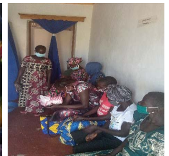
Patients and expectant mothers wait for their scans