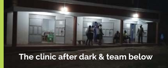
The clinic after dark & team below