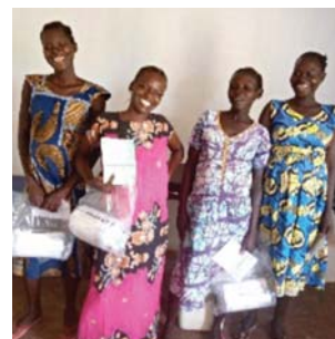
Excited expectant mothers receiving their Mama Kits

May saw 32 mothers giving birth in the clinic, the same as the whole of 2020!