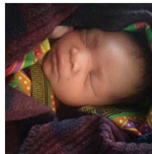
One of the babies delivered in the clinic